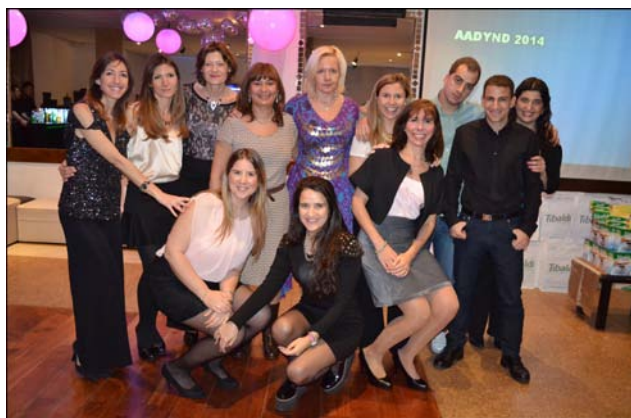
AADYND Board of Directors, Celebration of Nutritionist Day

AADYND was present in several graphic media, TV and radio through its Press Committee. AADYND supported the campaign “The first 1000 days of life”, numerous scientific meetings and continuing education courses. AADYND ended the year 2014 with a toast to its sponsors from the industry (in November) and with colleagues and Board of Directors (in December).