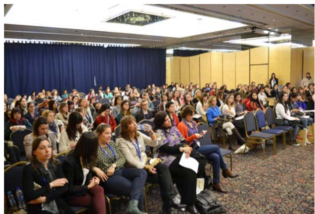
V Conference of Nutrition of the City of Buenos Aires